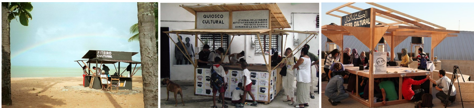
Beach kiosks ( fiteiros culturais ) in João Pessoa (PB), Cuba and Palestine