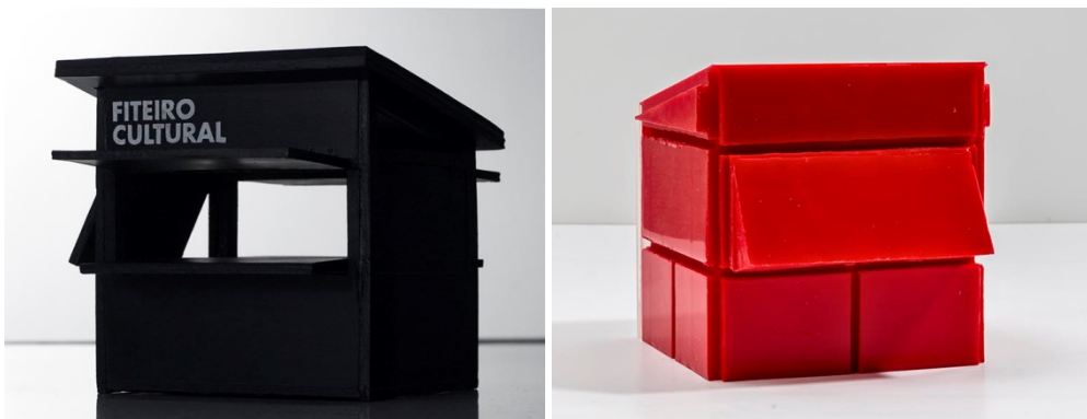
Original fiteiro model and new 3-D silicone model